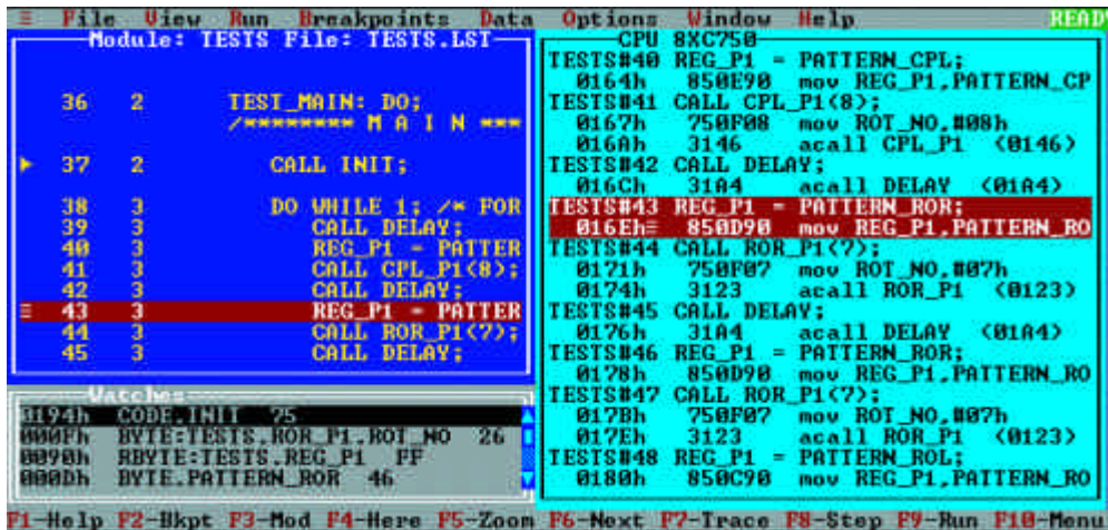
Figure 1: DS-750 Debugger

DS-750 program runs under DOS and MS-Windows. The program is based on pull-down menus with many useful debugging functions.