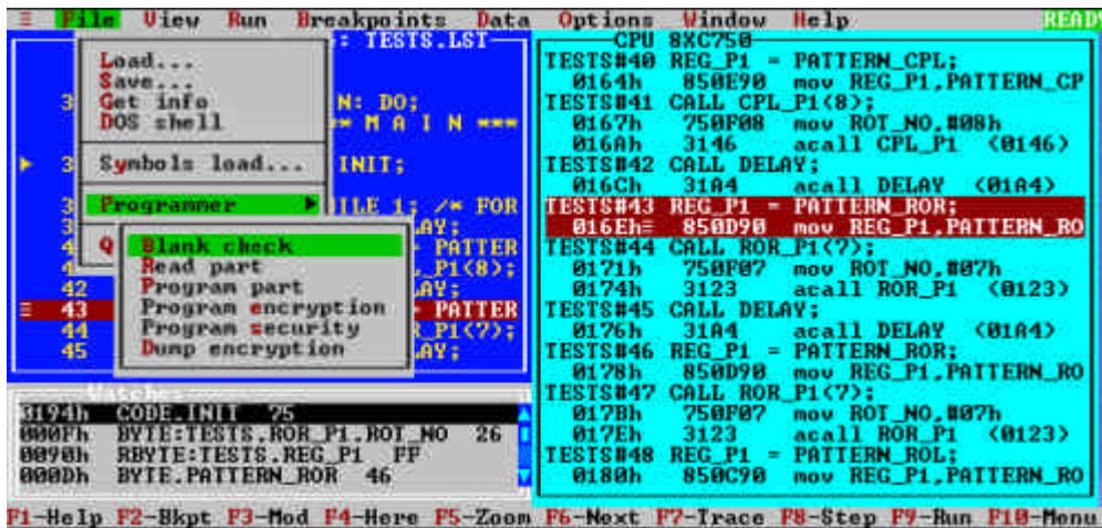
Figure 2: DS-750 Programming Capabilities

The Built-in Programmer may be used to program the following devices: 87C748, 87C749, 87C750, 87C751 and 87C752. All the programming features like security and encryption are fully supported.